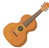
Guitar Turkey and Greece