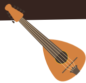
Oud Middle East