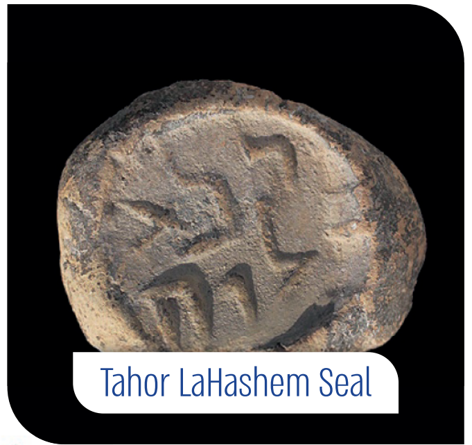
Tahor LaHashem Seal